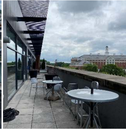
TERRACE VIEWS OVERLOOKING EASTON